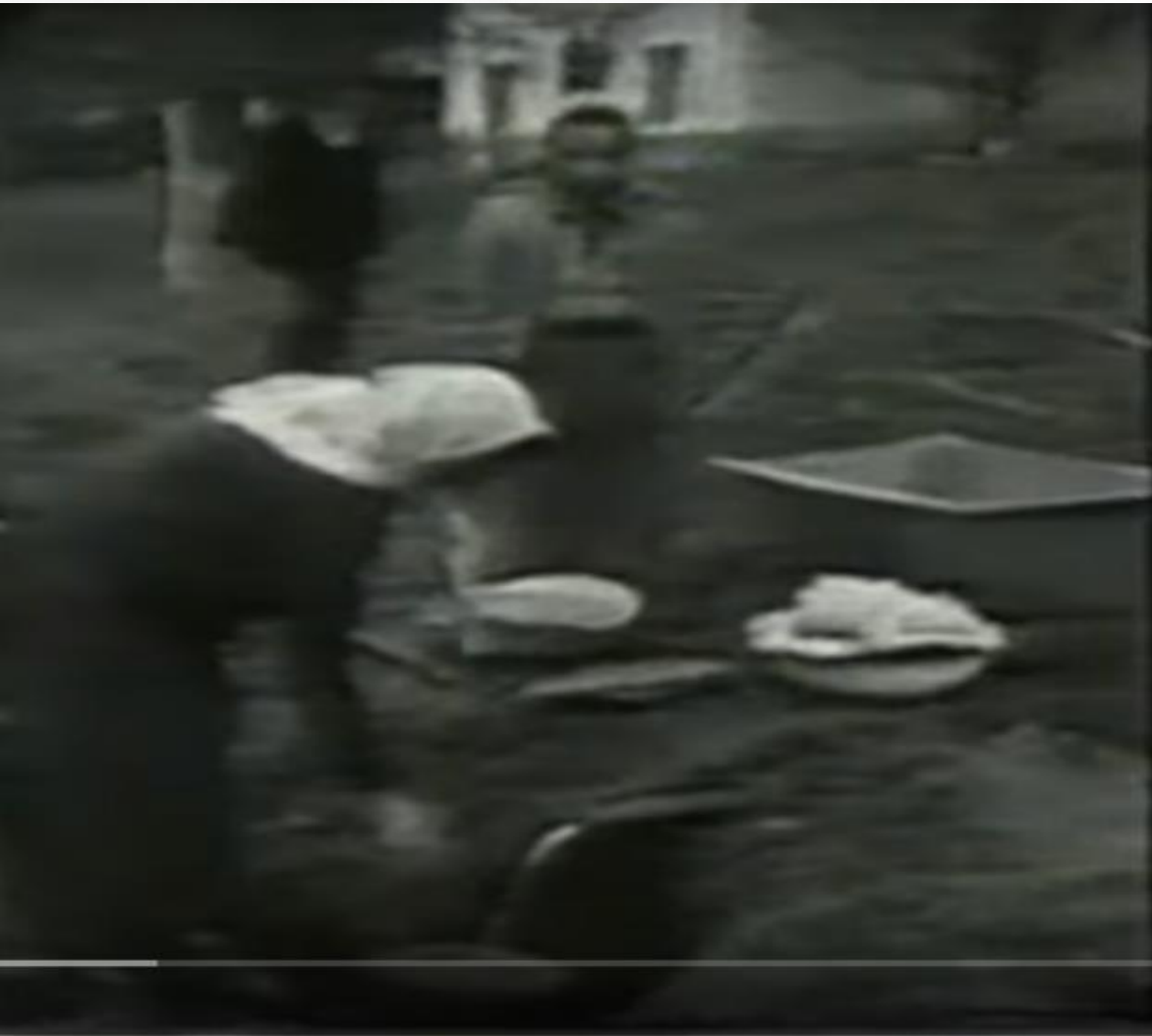
3 (dokumentarni film) Život u Lisičićima poslije potopa