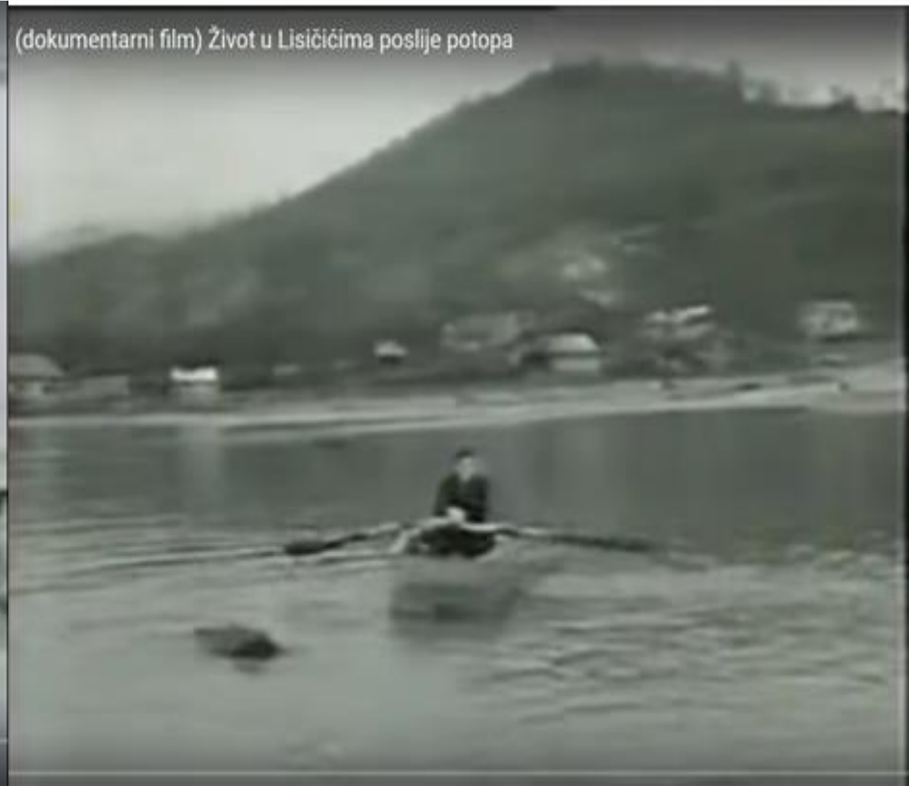
(dokumentarni film) Život u Lisičićima poslije potopa