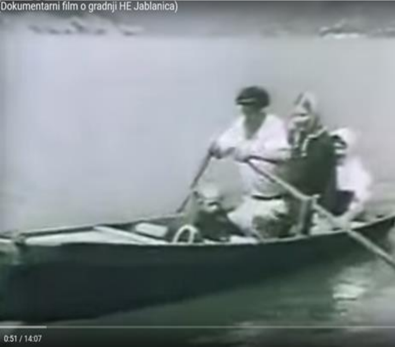
Dokumentarni film o gradnji HE Jablanica)