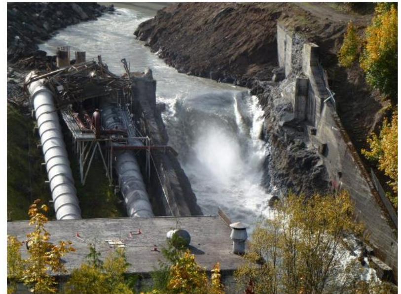
After the removal of the Elwha Dam in Washington state — the largest dam removal in U.S. history — the Elwha River is thriving.