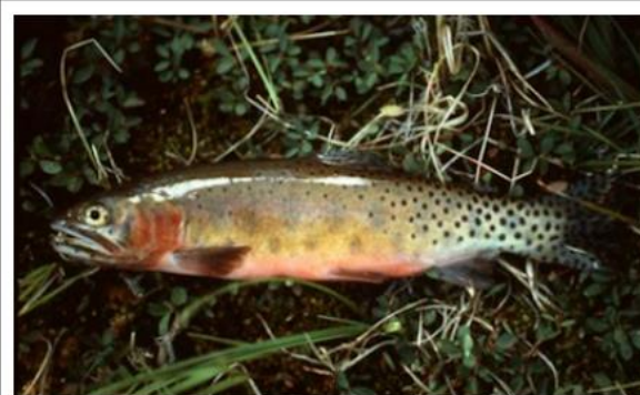
Green Linneage Cutthroat Trout.

Conservation Coalition Sends 'Notice Of Intent To Sue' Alleging Denver Water's Gross Dam Project Violates Endangered Species Act