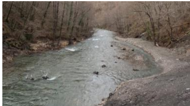
Leitzarain River after dam removal