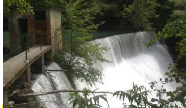
Inturia dam before removal

Information of the IREKI Bai EU LIFE project and Factsheet