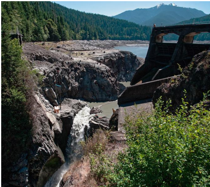
Removal works at Glines dam, Elwha River