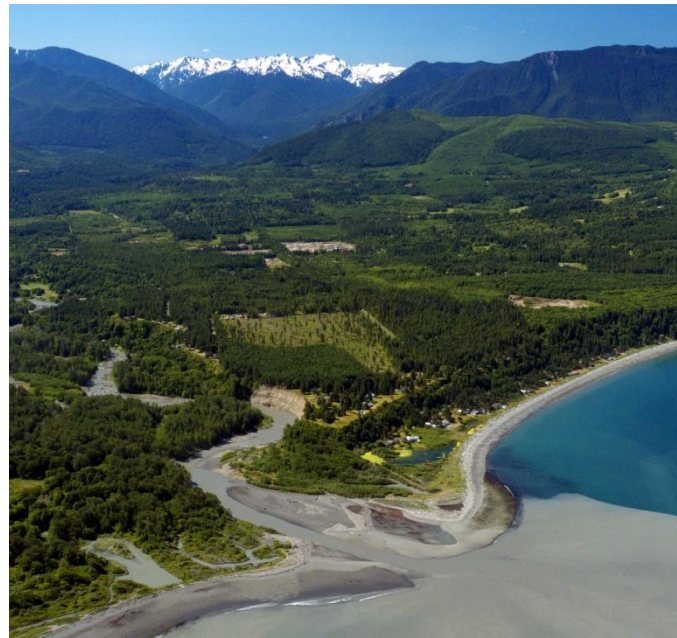
Restored coastal line after dam removals