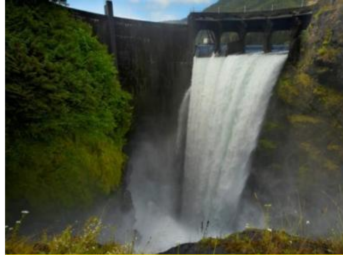
Glines dam before removal Elwha River