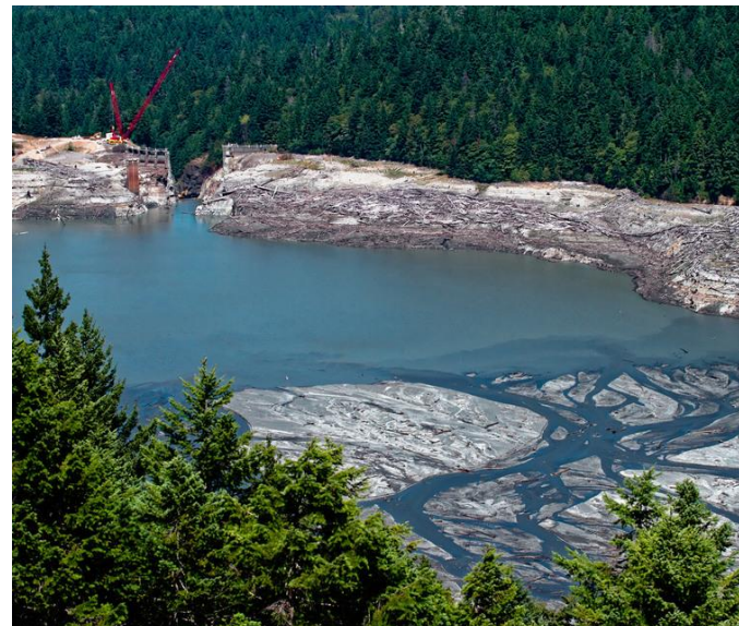
Gradual water release from artificial reservoir during removal works of Elwha river